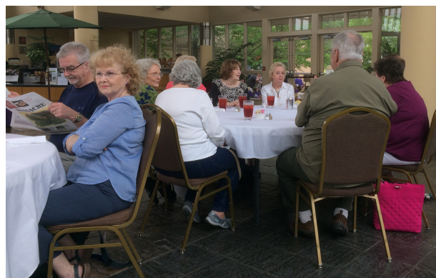
Some of the seniors who went on the May outing to the Botanic Gardens.

https://www.tripadvisor.com/Restaurant_Review-g55197-d835508-Reviews-La_Baguette_French_Bread_Shop-Memphis_Tennessee.html