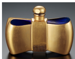
Bottle designed 1937 by Guerlain.

With its new exhibit, "Scent and Symbolism: Perfumed Objects and Images," the Gallery boasts a collection of 140 unique and beautiful fragrance bottles from the Umi-Mori Art Museum in Hiroshima, Japan. The bottles date from centuries past and come from countries around the world. Additionally, there will be paintings and works on paper that evoke one's sense of smell. In the Gardens the focus will be on fragrant plants. We will have