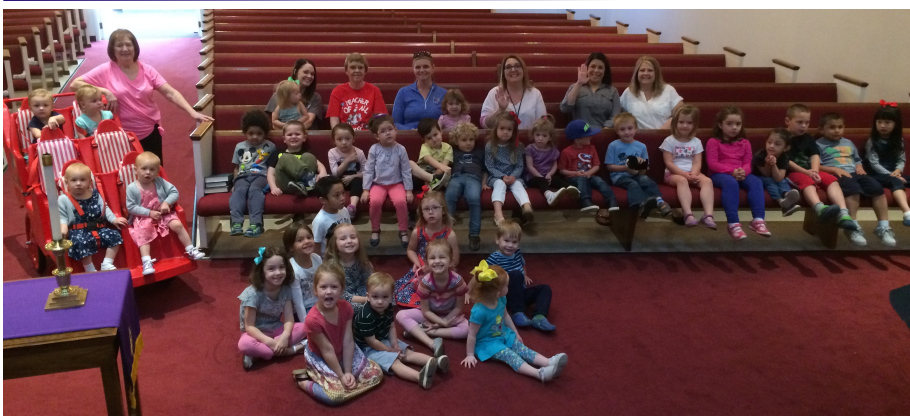
Our Tues/Thurs PDO kids with their teachers are watching a puppet show.