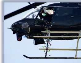
The sky wasn't falling but Easter Eggs were!

Lex's parents are Cortney and Billy Stone.