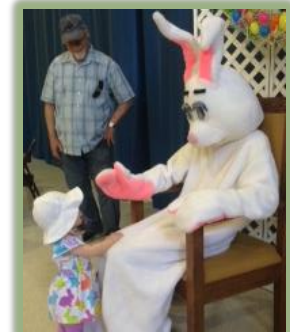
A visit from the Easter Bunny made it complete!