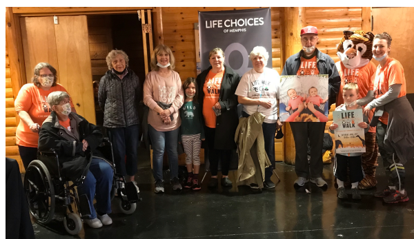
This is the team from 2020.

Each year HHPC has taken part in this fundraiser since 2016. Let’s do it again. We will have team as soon as Life Choices has it set up. Let’s have lots of walkers and give generously.